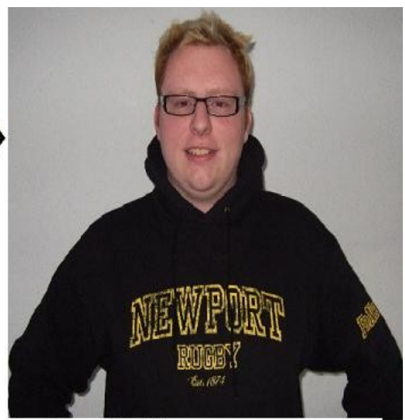
FoNR Cherub and NEWPORT style Hoodies and T-shirts T-shirts £10 adult £8 children's Hoodies £25

Friends of Newport Rugby Trust is all about helping to promote and support rugby being played here at Rodney Parade. Since being formed 7 years ago, we have contributed nearly £100k to help provide equipment and infrastructure much of which is of benefit to players and supporters of both the Club and the Regional sides.