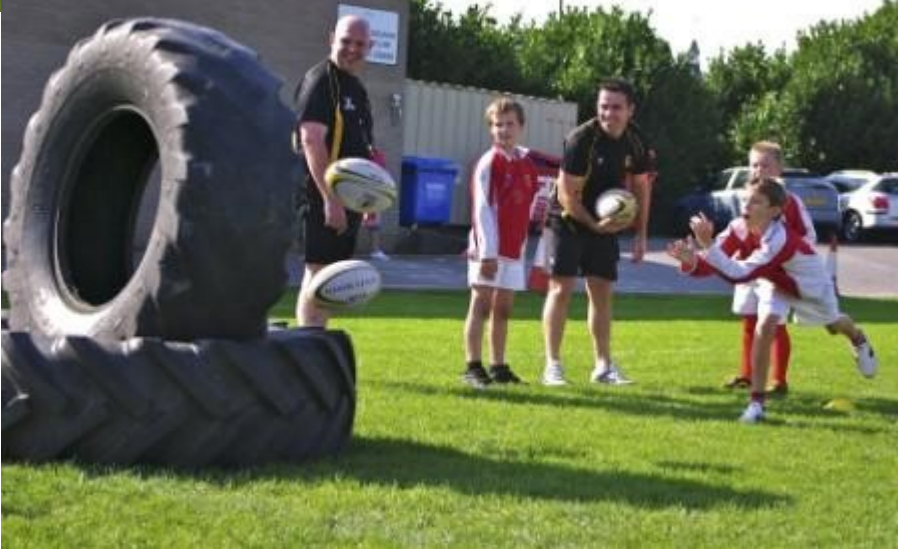
Undy Academy learning from the 'Master'!